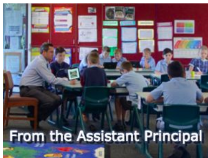
From the Assistant Principal

In 2019, all primary schools will implement the new Science Syllabus. This syllabus, like the History and Geography Syllabus implemented in 2017, has inquiry based learning at its center. Inquiry based learning is founded on pedagogical practices that put the student at the centre. It is a method of learning that also forms parts of our Literacy and Numeracy Block and Religious Education program at St Finbar's.