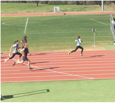
Boys Age Champi